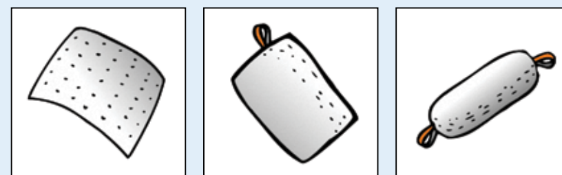
Absorbent Sheet Absorbent Pillow Absorbent Sock